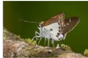
Moore's Wight ( Iton semamora )