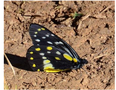
Hill Jezebel ( Delias belladonna )