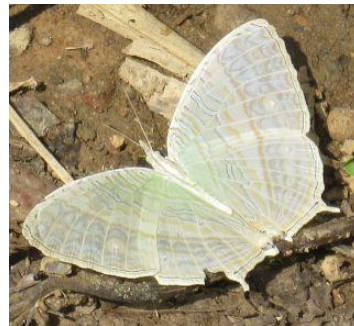
Marbled Map ( Cystis cocles )