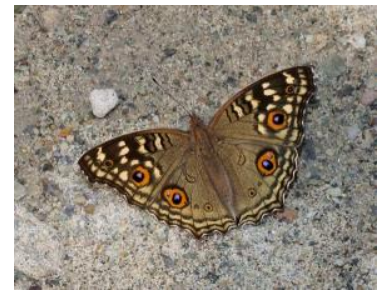
Lemon Pansy ( Junonia lemonias )