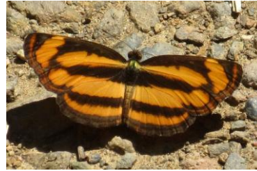
Common Lascar ( Pantoporia hordonia )