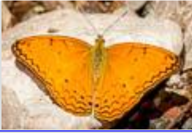
Common Yeoman ( Cirrocha baldus )