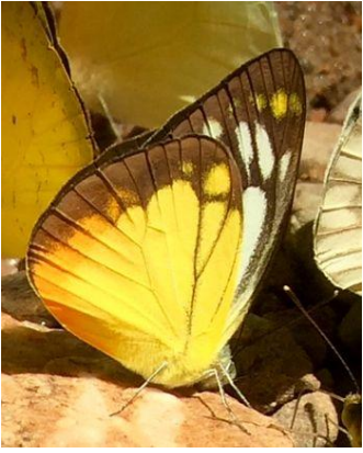
Orange Gull ( Cepora iudith )