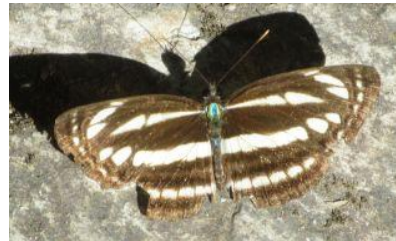
Common Sailer ( Neptis hylas )