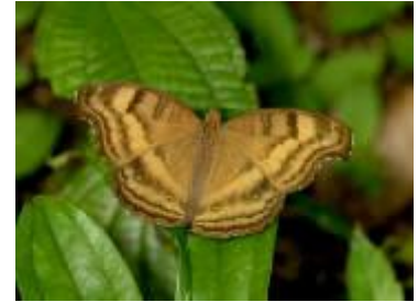
Chocolate Soldier ( Junonia iphtia )