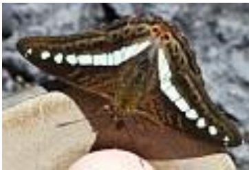
Green Commodore ( Sumalia daraxa )