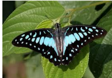
Common Jay ( Graphium doson )