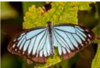
Common Wanderer ( Pareronia anais )