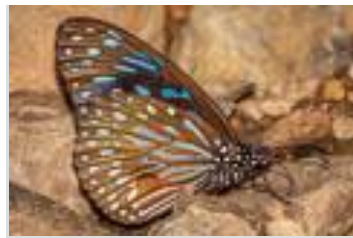
Dark Blue Tiger ( Tirumala septentiois )