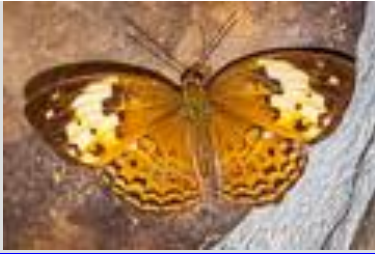
Rustic ( Cupha erymanthis )