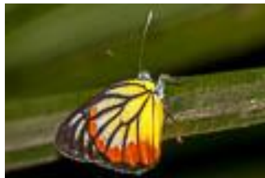
Painted Jezebel ( Delias hyparete )