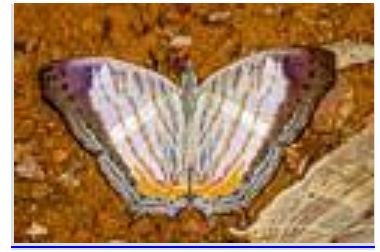
Little Map ( Cyrestis themire )