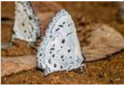
Common Hedge Blue ( Acytolepis puspa )