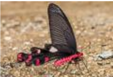
Great Windmill ( Atrophaneura dasarada )