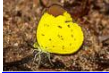
Chocolate Grass Yellow ( Eurema sari )