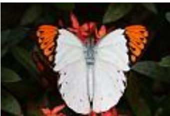
Great Orange Tip ( Hebomoia glaucippe )