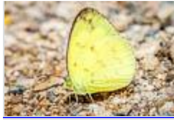
Common Grass Yellow ( Eurema hecabe )