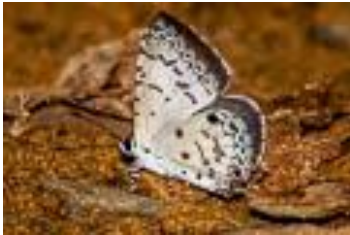
Malayan Pied Blue ( Megisba Malaya )