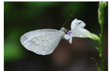
Psyche ( Leptosia nina )