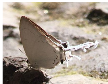
Common Imperial ( Cheritra freja )