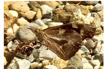
White-spot Beak ( Libythea narina )