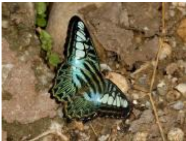
Clipper ( Parthenos sylvia )