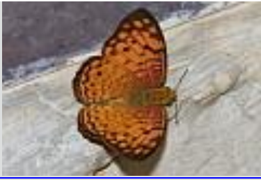
Small Leopard ( Phalanta alcippe )