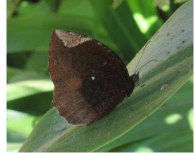
Common Palmfly ( Elymnias hypermestra )