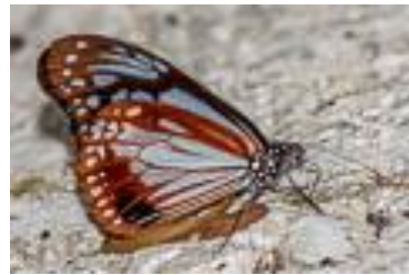
Chestnut Tiger ( Parantica sita )