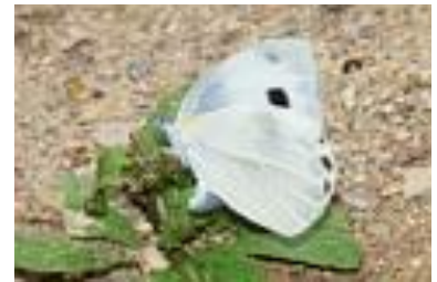
Indian Cabbage White ( Artoeaga candida )