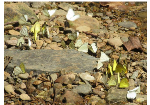
Puddling (males sip minerals from damp mud with their proboscis for use in the sperm packet)