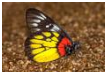
Redbase Jezebel ( Delias pasithoe )