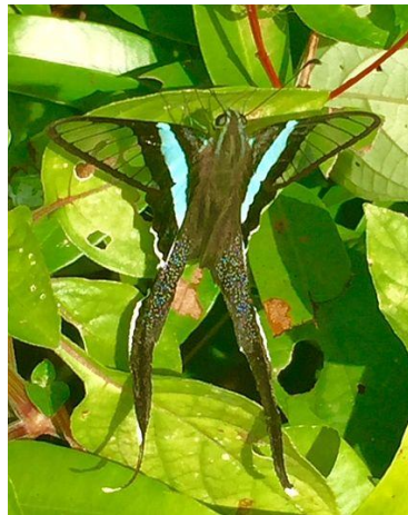
Green Dragontail ( Lamproptera meges )