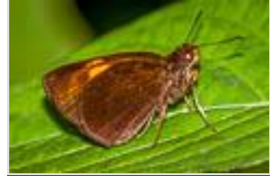
Bright Red Velvet Bob ( Koruthaialos sindu )