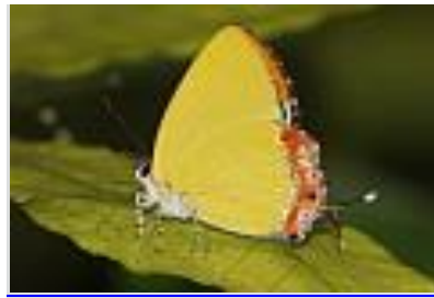
Purple Sapphire ( Heliophorus epicles )