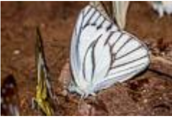
Striped Albatross ( Appias libythea )