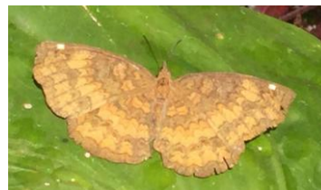
Common Castor ( Ariadne merione )