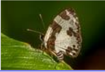
Elbowed Pierrot ( Caleta elna )