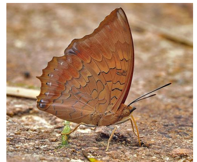
Tawny Rajah ( Charaxes bernardus )