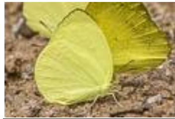
Tree Yellow ( Gandaca harina )