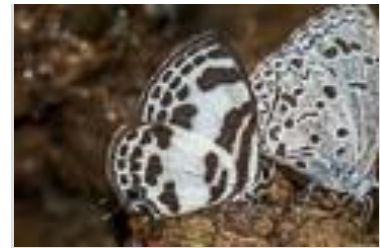
Banded Blue Pierrot ( Discolampa ethion )