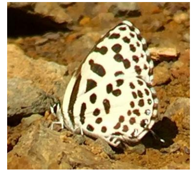
Common Pierrot ( Castalius rosimon )