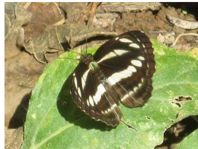
Burmese Sailer ( Heptis leucoporus )