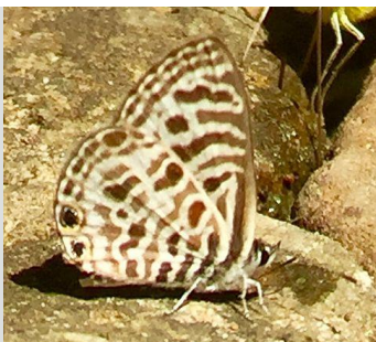
Zebra Blue ( Leptotes plinius )