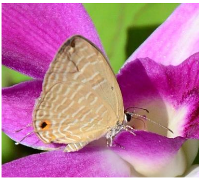
Common Line Blue ( Prosotas nora )?