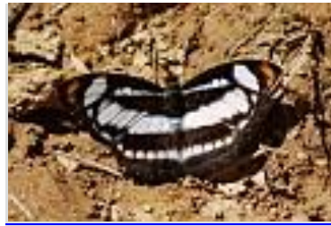
Colour Sergeant ( Athyma perius )