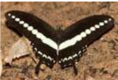
Banded Swallowtail ( Papilio demolion )