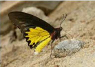
Common Birdwing ( Troides helena )