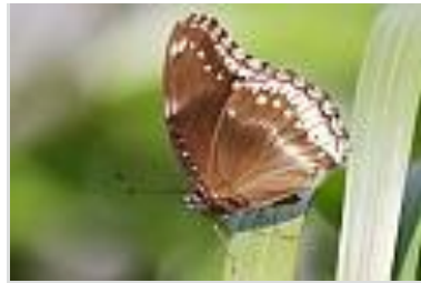
Great Eggfly ( Hypolimnna bolina )