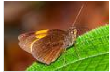
Red Demon ( Ancistroides armatus )