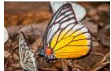
Redspot Sawtooth ( Prioneris philonome )