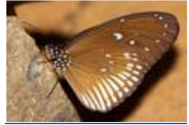
Lesser Striped Great Crow ( Euploea eyndhovii )