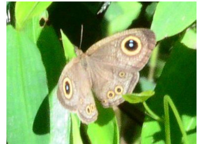
Common Fivering ( Ypthima baldus )