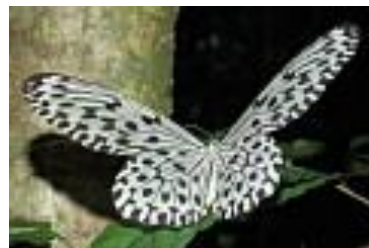
Ashy-white Tree-Nymph ( Idea stollii )