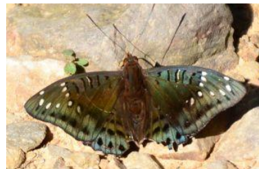
Green Baron ( Euthalia adonia )