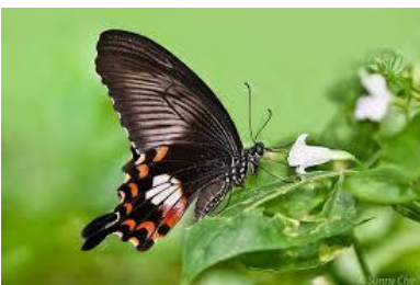
Common Mormon ( Papilio polytes )