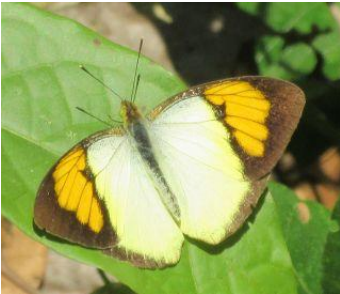
Yellow Orange Tip ( Ixias pyrene )